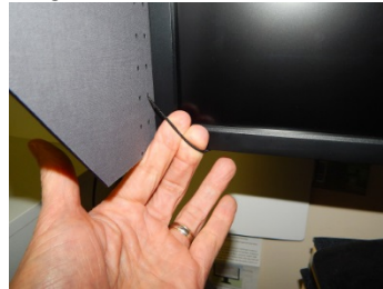
Image 3 Front of Monitor

Standing in front of the monitor, pull one side out (image 2) and loop the elastic cord around the corner of the monitor as shown (highlighted in image 3). Repeat for the opposite side.