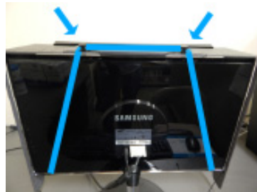
Image 1 Back of Monitor – Ensure elastic cord (highlighted in blue) is looped around the top knobs.

Place the hood on the monitor with the elastic cords behind the monitor.