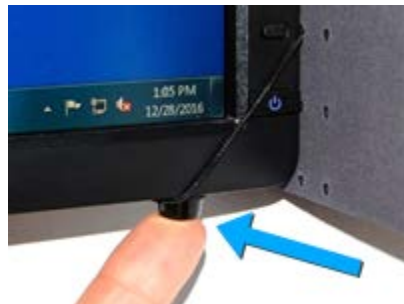
Image 4 Round button placement

Standing in front of the monitor, pull one side out (image 2) and loop the elastic cord around the corner of the monitor as shown (highlighted in image 3). Repeat for the opposite side.