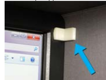
Image 5 Support bracket placement, actual brackets are black.

The black support brackets will keep the top of the hood from sliding backwards. The hood can be tilted slightly up or down to give it the desired look you like. Look at it from all angles. Remove the red tape from a support bracket to reveal the adhesive. Place the bracket to the top inside corner of the hood, tight against the monitor (image 5). Press firmly to adhere. Repeat on the other side. If removal of the bracket is necessary, gently twist and pull.